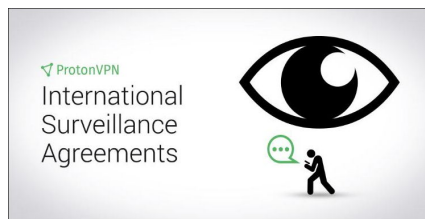
The Five Eyes

"A VPN can encrypt your internet connection and allow you to 'virtually' locate your computer in 100's of locations around the world."